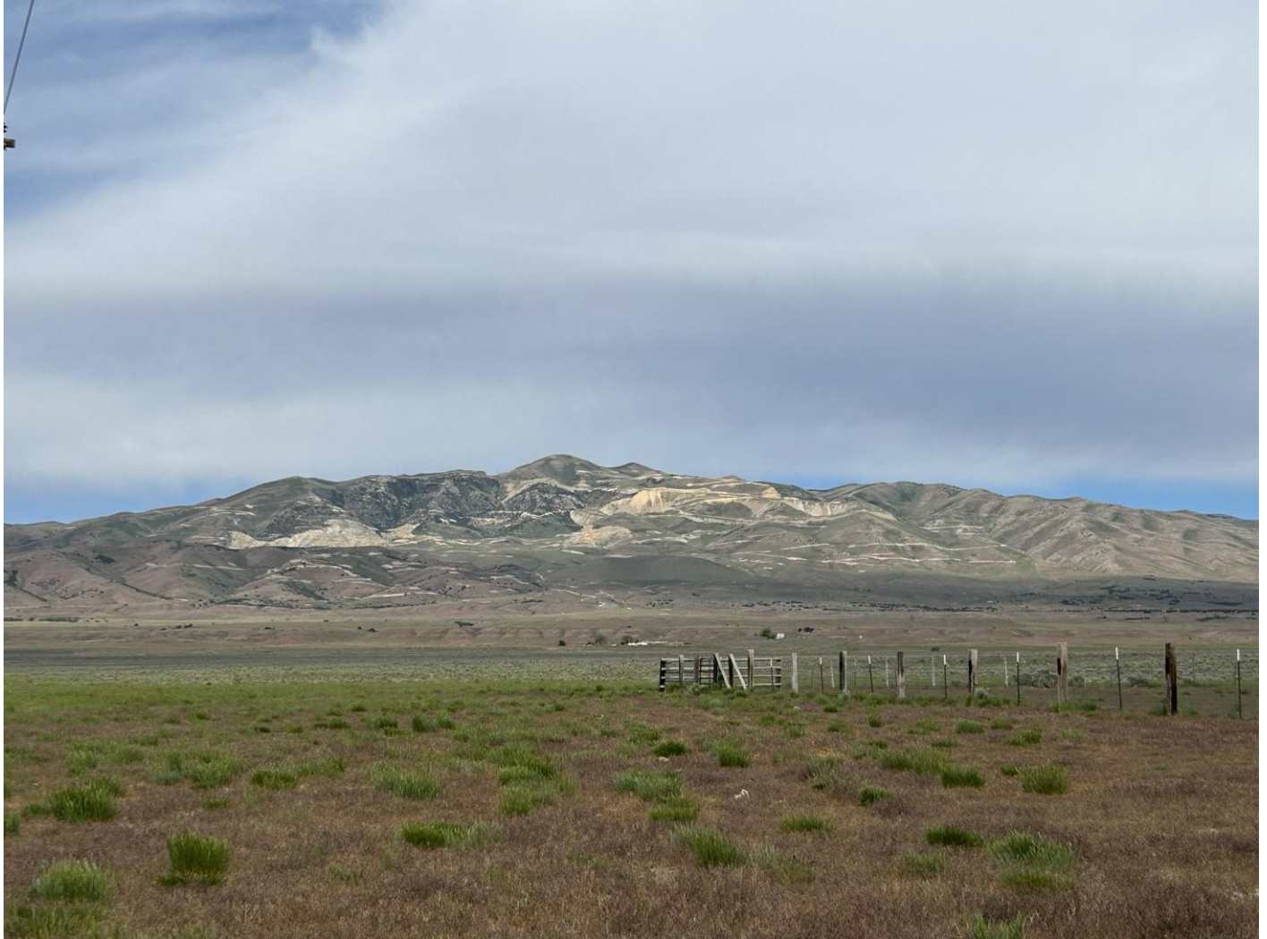
Figure 1: View of the Black Pine Project Area from the Valley Floor, Showing Broad Oxide System and Historic Mining Footprint