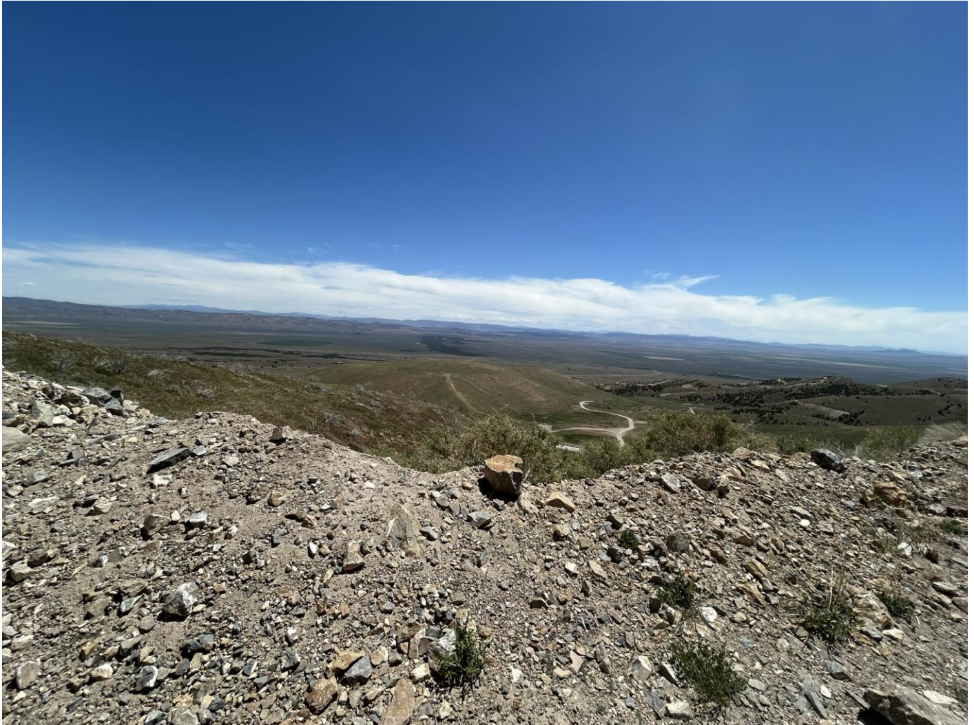
Figure 3: Black Pine Site View — Looking East Across the Valley and Existing Access Roads