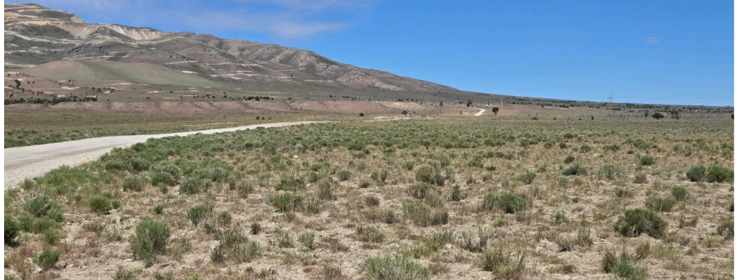
Exhibit 2 - Legacy heap leach (middle left, now reclaimed), with proposed new heap leach pad location in foreground.