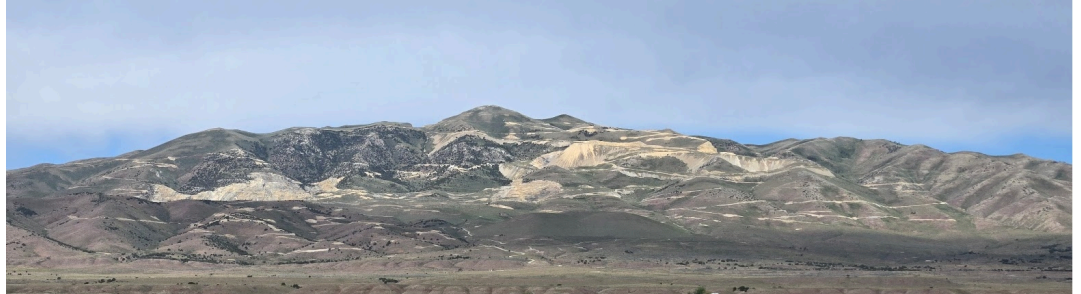
Exhibit 1 - Overview of the Black Pine property, with Rangefront in the foreground and Discovery at higher elevation.